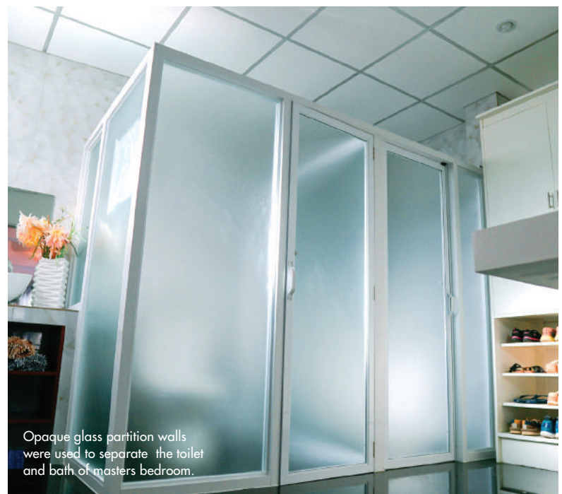
Opaque glass partition walls were used to separate the toilet and bath of masters bedroom.