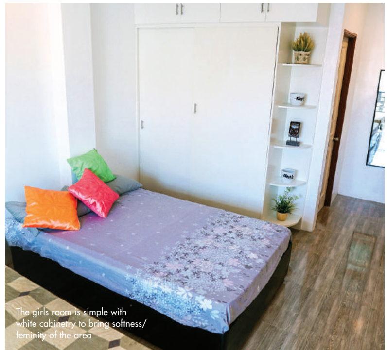
The girls room is simple with white cabinetry to bring softness/ femininity of the area