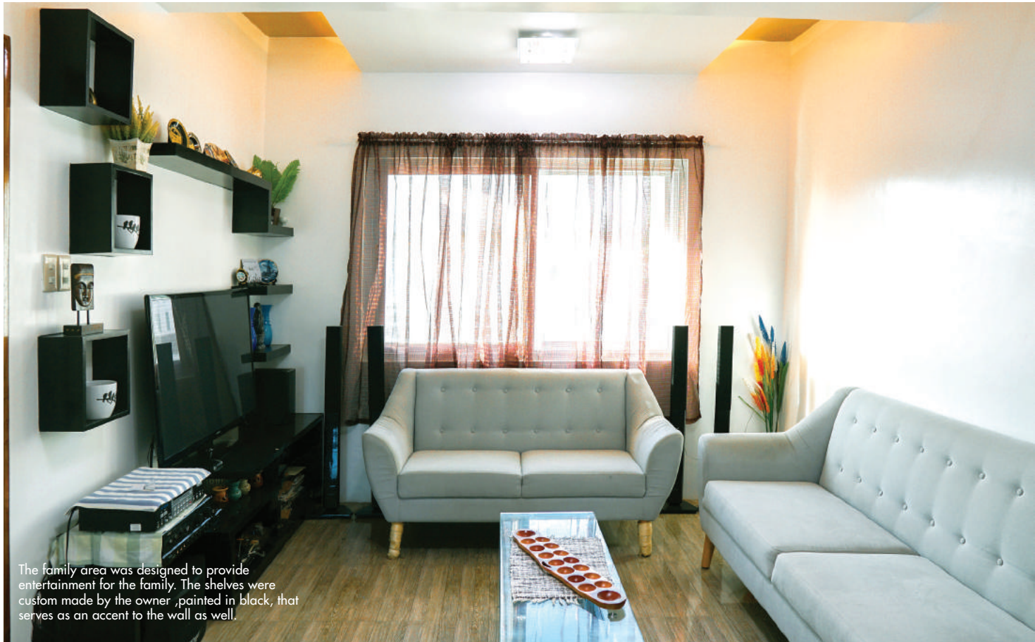
The family area was designed to provide entertainment for the family. The shelves were custom made by the owner, painted in black, that serves as an accent to the wall as well.