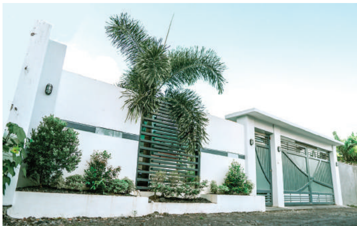
The front gate is a custom designed gate made of steel. The design incorporates curve lines to provide contradiction to the vertical and horizontal lines of the building.