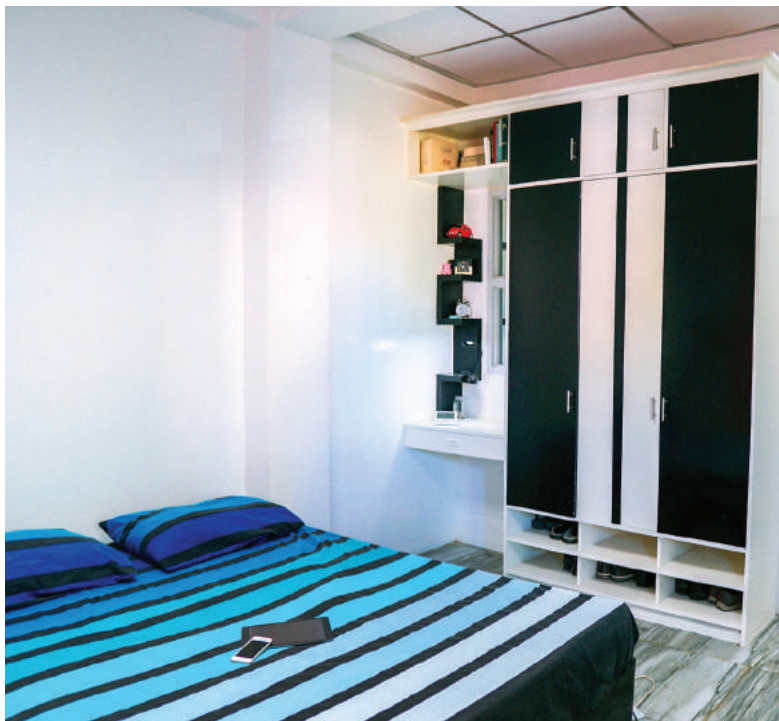
For the boy's room/xedric's room.the black paint in the cabinets shows the masculinity of the room.