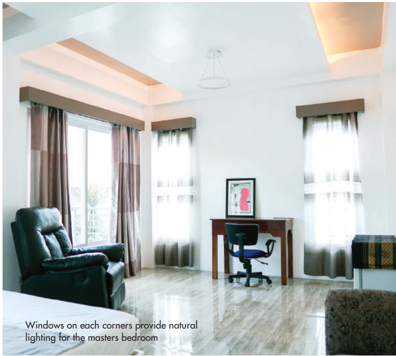
Windows on each corners provide natural lighting for the masters bedroom