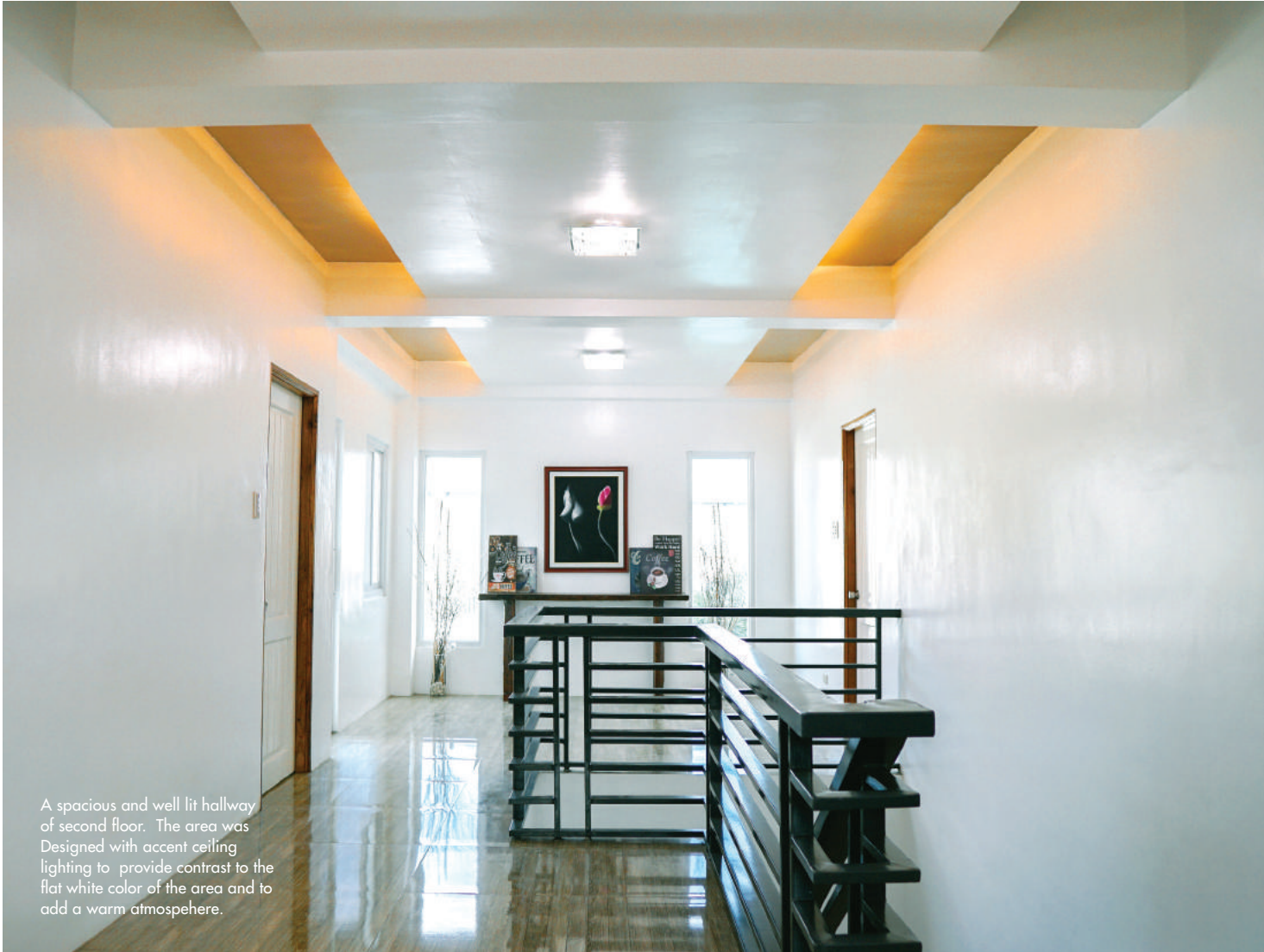
A spacious and well lit hallway of second floor. The area was Designed with accent ceiling lighting to provide contrast to the flat white color of the area and to add a warm atmosphere.

known in the Philippine architectural scene. The firm's vision is to "implement its expertise on a wide range of projects and to scale to bigger heights by continuously sharpening its architectural edge."