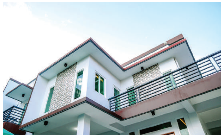
The exterior view of from the ground showing the contemporary building lines