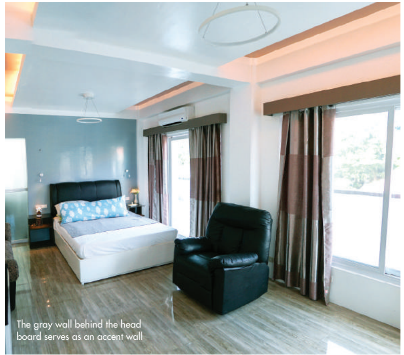
The gray wall behind the head board serves as an accent wall