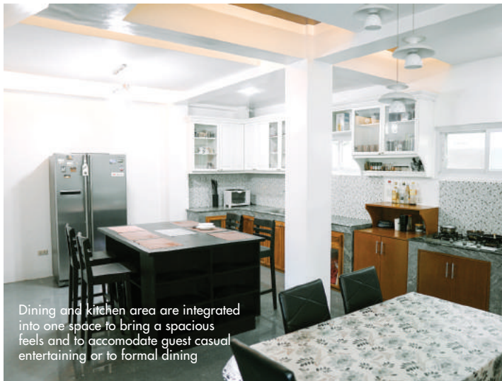
Dining and kitchen area are integrated into one space to bring a spacious feels and to accommodate guest casual entertaining or to formal dining