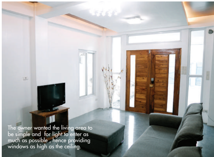
The owner wanted the living area to be simple and for light to enter as much as possible, hence providing windows as high as the ceiling.

dealism, they say, is within the youth's nature. A fresh enthusiasm and aspiration for self-determination are now more imbibed by today's young career-driven individuals.